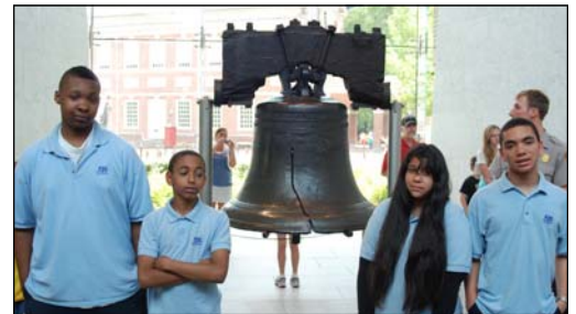
History Fair winners visit the Liberty Bell.

During our hours of walking around we visited various tourist attractions such as the U.S. Mint, Independence Hall, the Federal Reserve Bank, the Liberty Bell and many other places.