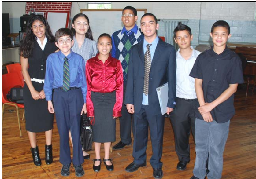
Dress Up Day

On May 24 through May 29, Student Council sponsored FJS's very first School