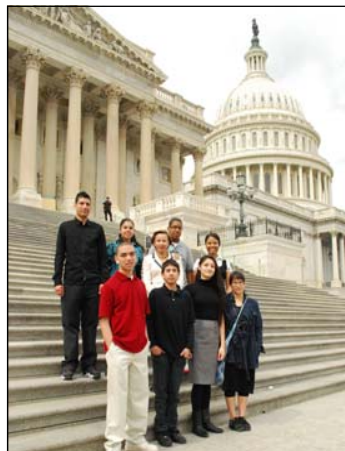
The U. S. Government class on the capitol steps with Nydia Velasquez, our congresswoman (center)

It was an interesting, fun, challenging, and tiring trip but we were glad to have a unique experience where we could bond in a way that wouldn't have been possible at school.